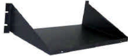
P70-0353 Front Shelf 19" x 16" Black